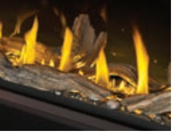
High-definition driftwood logs