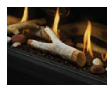
Birch log kit