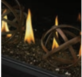
Wrought iron globes