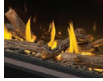
High-definition oak logs

Recommended: Combination of logs with glass beads, embers or optional enhancement kit or glass, or media/glass on its own