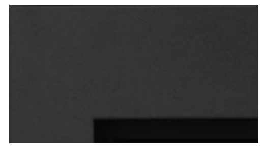
Classic black surround