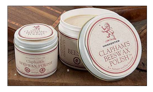
Beeswax referenced below