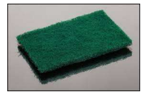
Scotch Brite green buffing pad

Your concrete firepit may slightly fade, patina, and/or watermark over time. This is natural and normal. If you wish to bring it back closer to its original colour it will require a gentle buffing with a clean Scotch Brite green pad (or something similar to what is pictured below) and then a liberal application of stone sealer. (Any stone sealer will suffice including Miracle 511 or a stone sealer from Home Depot, B & Q (UK), or a similar retail store)