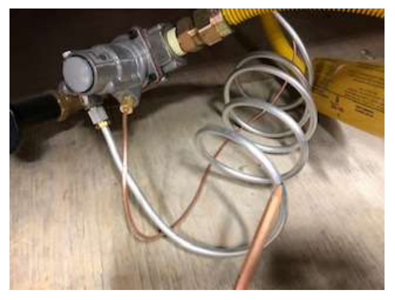
Inlet Tube pictured below the Universal Pilot

Universal Pilot J985 – *Clean the spark rod tip with steel wool to remove any tarnish or dirt. ***If gas flow weakens over time remove inlet and wash with mineral spirits and clean inside the inlet tube.