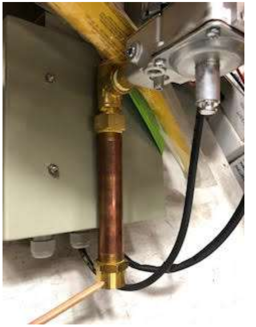
Pointing at the endcap of Condensation Chamber

***Remove the end cap and drain off any water. Install the end cap with fresh Teflon tape and check for gas leak.