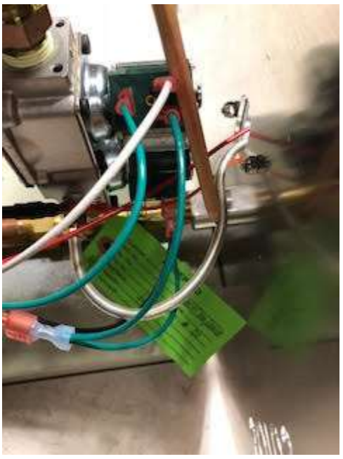
Inlet Tube pictured below the Universal Pilot

Intermittent Pilot J996 – *Clean the spark rod tip with steel wool to remove any tarnish or dirt. ***If gas flow weakens over time remove inlet and wash with mineral spirits and clean inside the inlet tube.